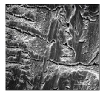
After Leading Synthetic*