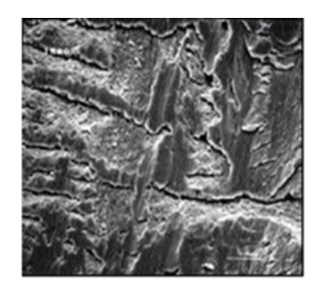
After Leading Synthetic*