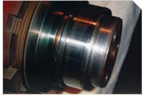
FIGURE 4 - NSK #NU326 280mm oil-lubricated bearing after more than 80,000km of high-speed service.