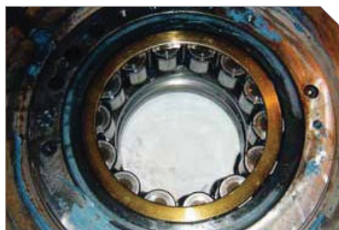
FIGURE 3 - Inner race of same NH219 greased bearing after disassembly.