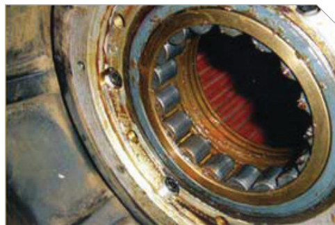
FIGURE 2 - NSK #NH219 170mm greased bearing after more than 80,000km of high-speed service.