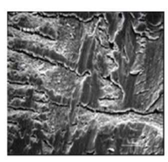
After Leading Synthetic*