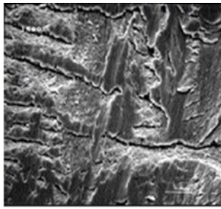
After Leading Synthetic*