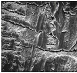
After Leading Synthetic*